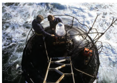
Left: This is a really unusual view of Bell Rock lighthouse – the top of the lantern dome. A couple of keepers work on the emergency beacon while another captures the scene from the ladder that leads to the anemometer – the highest point it is possible to climb to on the lighthouse.

Throughout June large numbers of men worked feverishly between the tides to excavate the footings of the light and to erect the railway from their workings to the various landing points. Within the circular base of the tower any irregularities of level caused by fissures were filled by 18 variously shaped blocks which were loaded on to row-boats and dropped over the site at high water as the railway was not yet complete. Once in position, a circular base 42 ft across with a perfectly smooth floor was ready to receive the first complete course of 123 stones. The first was set on 10th July and the remainder occupied the rest of that month. Every block