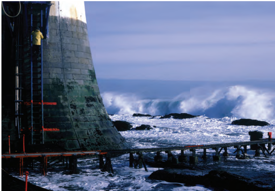
Above: Huge rollers break against the Inchcape Rock from the east. The iron walkways are seen to good effect in this shot.