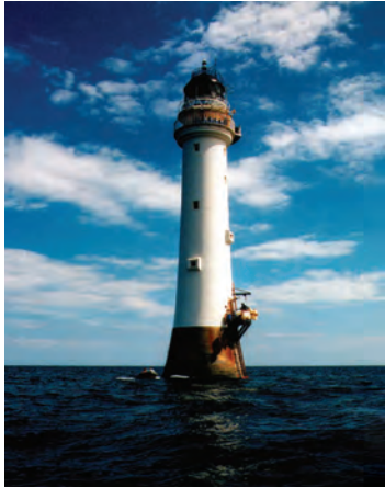
Left: At high water there is no sign of the Bell Rock reef – it appears as if the lighthouse rises straight out of the sea.

Bell Rock continued to claim its victims to such a great extent that the Northern Lighthouse Board was forced to act. In 1800 the members detailed their chief engineer, Robert Stevenson, to study the feasibility of erecting a warning structure on this "frightful bar to navigation." He made extensive tours around the existing lighthouses of the British Isles before arriving at the conclusion that for such a site only a stone tower would be resilient enough to