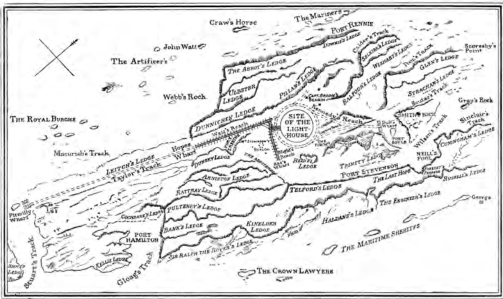
Left: One of Stevenson's early plans of the Bell Rock showing the site of his proposed lighthouse, the cast-iron tramways he proposed to build, and the site of his beacon. Many of the names given to the ledges, tracks and channels were those of the workman building the light.

The story of this lighthouse has many parallels with the Eddystone, although the reef on which it stands could not be more different. Whereas Eddystone appears as three separate, jagged and converging ridges, rearing sharply from the English Channel, the Inchcape presents itself as a broad, serrated bed of sandstone, rising 27 miles east of Dundee and some 11 miles distant from Arbroath. Its area is extensive when compared with other sea rocks, being approximately 2,000 ft long by 330 ft wide, rising sharply on three sides but shelving away