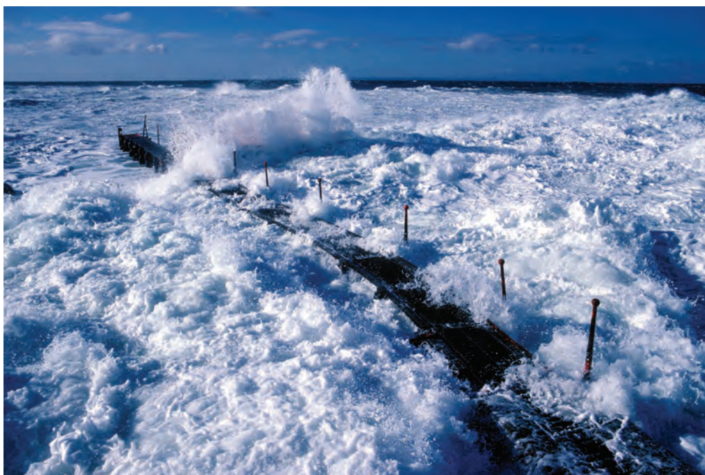
Right: This is what the Bell Rock reef looks like as a rising tide with a strong wind stirs the whole reef into a maelstrom of white water. There were no second chances for vessels driven onto this particular graveyard. (Jim Bain)

The Commissioners of Northern Lighthouses had been entrusted with the erection and maintenance of beacons in Scottish waters since 1786. They were not blind to their responsibilities over Bell Rock but could find no bank willing to advance the many thousands of pounds which would be necessary for the placing of a beacon on such a hazardous site. Its design, too, was proving elusive. Many and varied were the structures proposed by private individuals – stone towers on hollow metal legs filled with sea water, stone towers on stone legs, a solid stone base built on a wooden raft, floated into position and sunk. There were more,