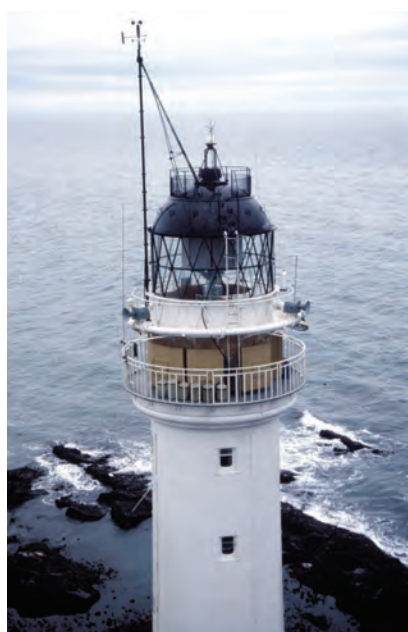
Left: This view of the lantern from an NLB helicopter shows exactly how the previous photograph was taken. The ladder to the weather vane and anemometer leans against their support, although a head for heights was clearly needed if any work was to be done on the instruments. Bell Rock used to be a Met Office coastal reporting station.