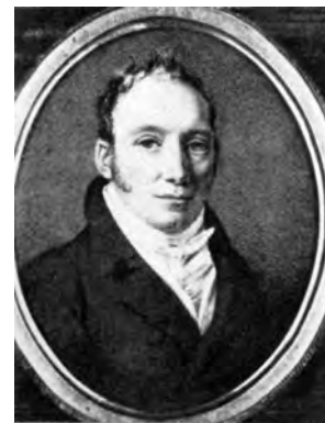
Left: Robert Stevenson (1772-1850) the engineer of the Bell Rock lighthouse.

During the early months of 1807 the tedious but necessary business of employing masons, blacksmiths and foremen began. A base was established at Arbroath where the stones would be cut and dressed before despatch to the rock. Two sailing vessels were acquired by Stevenson. The Pharos was a 70 ft Prussian fishing vessel which was to serve as a temporary light and barrack for 30 of the artificers, while the Smeaton was a specially built tender of 40 tons to be used for the ferrying of rough stone from the quarries into the yards at Arbroath, and the finished product to the reef. She could also accommodate 24 men. The Pharos was towed into position in July and anchored a mile off the rock, from where a light was exhibited on 15th September onwards. On 17th August the Smeaton was sailed to her moorings a quarter of a