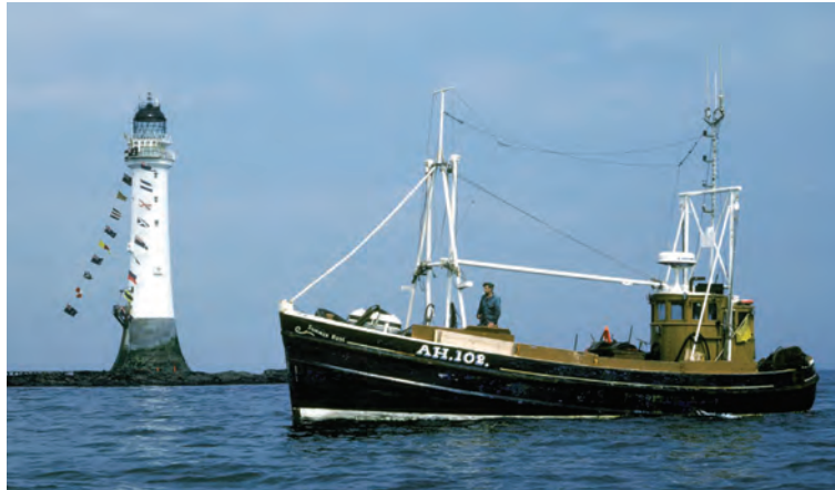
Left: The Summer Rose from Arbroath was the Bell Rock supply boat, although on this day there is not much to supply as the lighthouse is being converted to automatic operation. The solar panels are in position on the gallery, but there is no lens in the lantern. Two temporary lanterns have been stacked on top of one another on the roof of the dome. The flags decorating the tower are to celebrate its 175th anniversary.

would become redundant. It was decided to install these in the Bell Rock. The paraffin vapour burners were removed and replaced with a 3,500 watt electric light bulb which produced 1,900,000 candlepower in a single white flash every